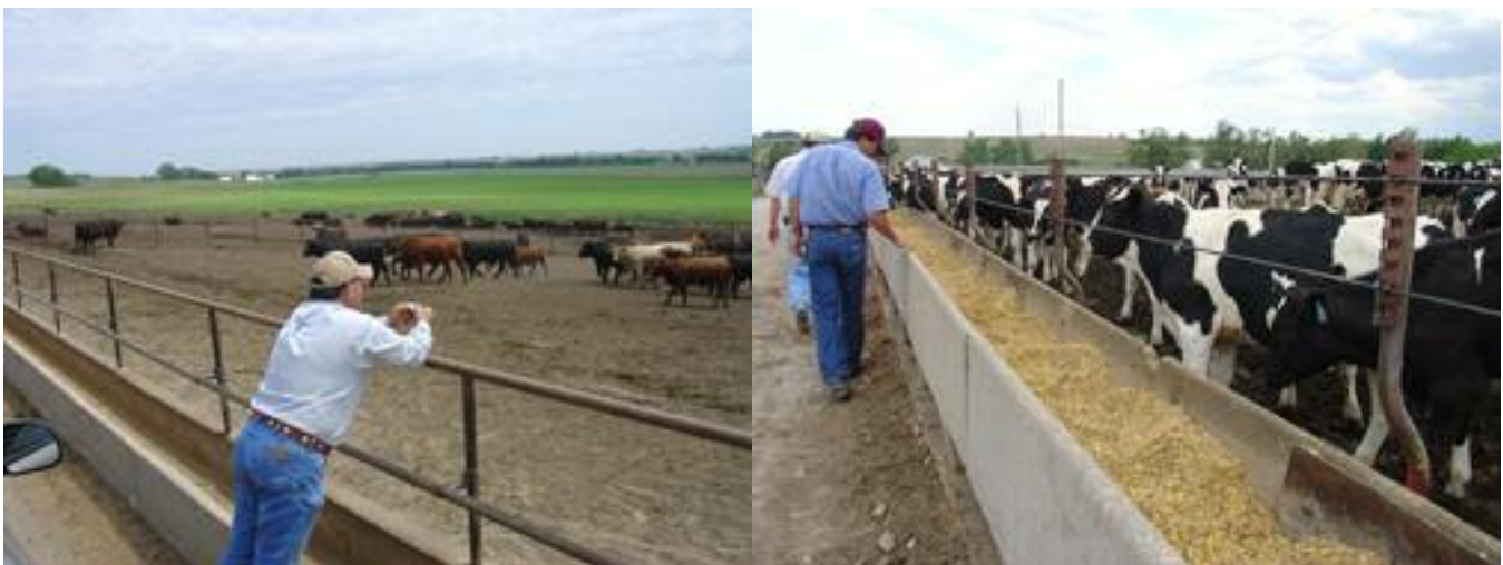
Mississippi beef cattle producers visiting prospective feedlots.

Some feedlots also offer backgrounding services for producers who want to send cattle not yet ready for the finishing phase. Many feedlots that do not provide custom backgrounding have a working relationship with custom backgrounders or stocker operators. These operations can add weight to cattle on a cost-of-gain basis and prepare young or lightweight cattle for optimal feedlot performance. This might be